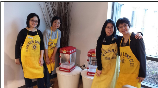
Welcoming all with the all-welcoming aroma of freshly made popcorn

We presented the project as an entry to the Colwell Award at our District Convention, and we won the Colwell Award!