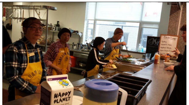
Our Lion "kitchen" crew all geared up to serving a delicious and heart-warming Easter Dinner..."Happy Planet" it is!