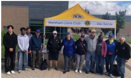
L-R Markham Lions & Friends

On Saturday, September 7, 2024 the Markham Lions set up their tent at the Angus Glen Community Centre where a Ringette Tournament was being held. We sold hamburgers and hot dogs to the hungry attendees. The Ringette coaches and players help us out at our Food Booth at the Markham Fair, which we greatly appreciate. The accompanying photo is of Markham Lions and Friends who worked the event.