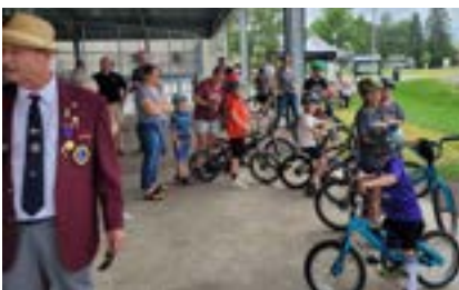
Pump Track Opening

Euchre Tournaments (once a month) - We run monthly euchre tournaments with anywhere from 20 - 40 people coming to have a great time. Fee is $20.00 per person with cash prizes for 1st, 2nd, 3rd, Most Lone Hands and Boobie Prize (Lowest Score). Bingo (once a week) - Bingo is a popular event in Pefferlaw with over 100 people per week. We have a potential prize pot of $2000.00 based on the progressive number each week. It is a don't miss for any Bingo lovers.