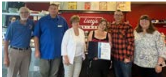
Lucy's Diner Opening