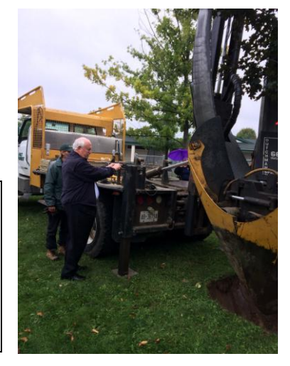
Planting a tree in the Memorial Forest