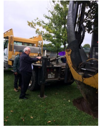
Planting a tree in the Memorial Forest