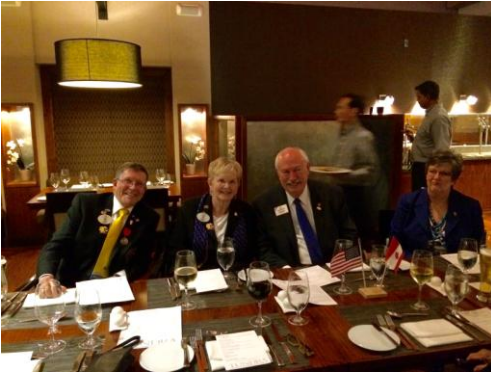
Dinner at the Hilton...forgive the bright tie!