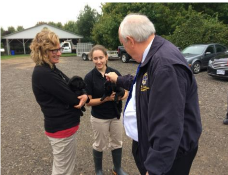
Two puppies going out to foster homes that day.