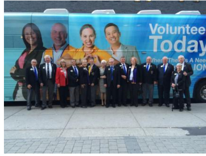
The Bus Arrives!