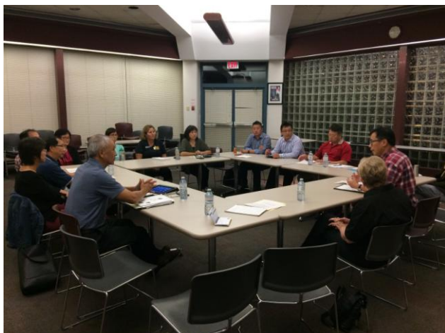
First Official Meeting of the Newly Chartered Angus Glen Lions Club

Huge thanks to all the clubs and especially our Global Membership Team.