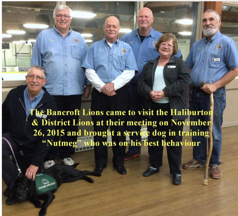
The Bancroft Lions came to visit the Haliburton & District Lions at their meeting on November 26, 2015 and brought a service dog in training "Nutmeg" who was on his best behaviour