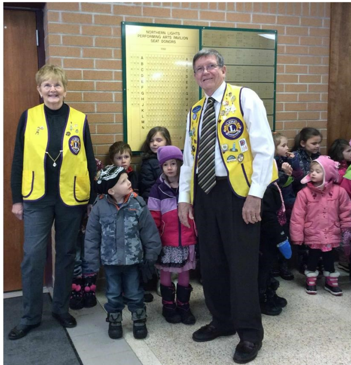
THE LIONS ARRANGED AND PAID FOR BUSES TO BRING THE STUDENTS OF CARDIFF ELEMENTARY SCHOOL TO HALIBURTON ON DECEMBER 4, 2015 TO SEE THE NUTCRACKER PRODUCTION AT THE NORTHERN LIGHTS PERFORMING ARTS PAVILLION