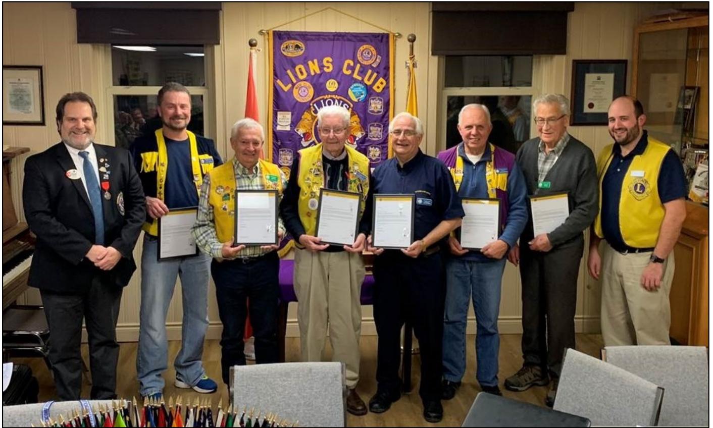
Pictured Left to Right.