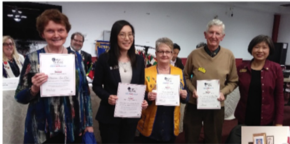
Region 18 (l to r), Markham LC, Ontario York Region Heritage LC, Aurora LC, and Thornhill LC.

To recognize the accomplishment of the clubs, I had the honour to present the Certificates of Appreciation from Lions Foundation of Canada to the following clubs at the March Joint Zone Meeting. Thank you for your support!