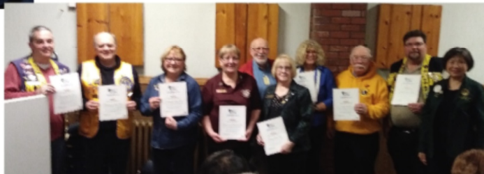
Region 52 (l to r), Woodville LC, Bobcaygeon LC, Halliburton LC, Fowlers Corners LC, Fenelon Falls LC, Lindsay LC, Omemee LC, Dunsford LC, and Kirkfield LC. Not in the picture: Omemee Lioness.