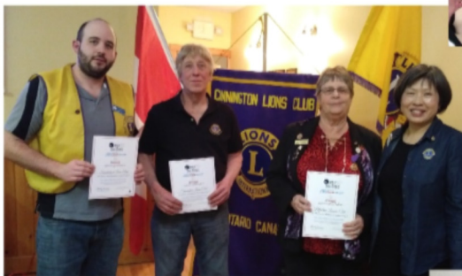
Region 45 (l to r), Sunderland LC, Cannington LC, and Pepperlaw Lioness Club. Not in the picture: Beaverton Lioness Club.