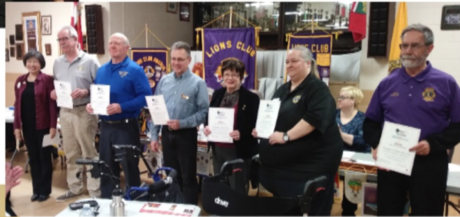
Region 33 (l to r), Goodwood LC, Blackstock-Cartwright LC, BAM LC, Claremont LC, Ajax LC, and Uxbridge LC.