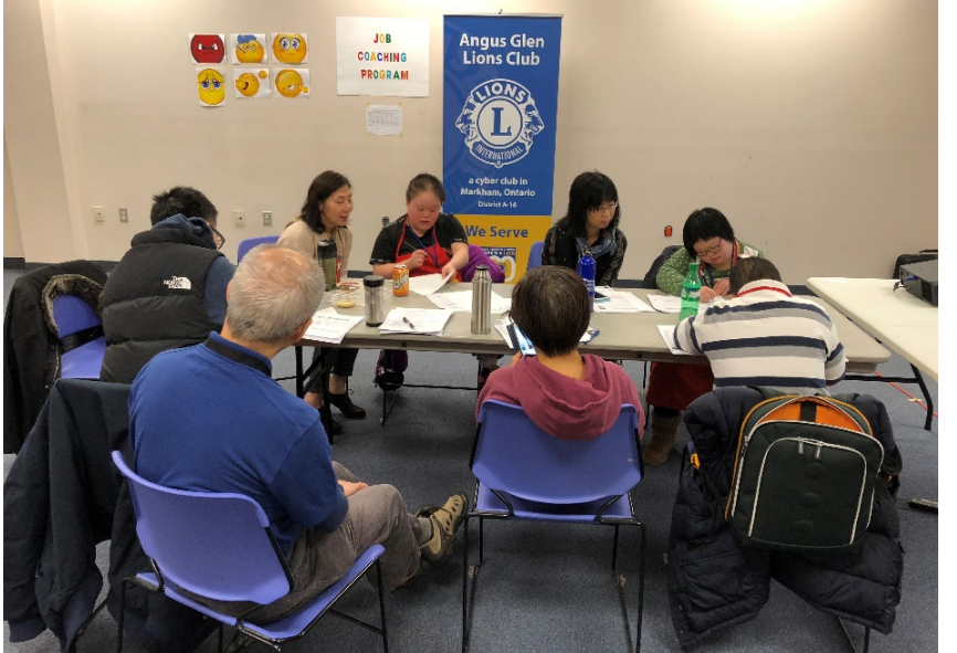
Angus Glen Lions and other volunteer coaches at the Train-the-trainer session.

Participants working with their Coaches in preparing for a job Interview.